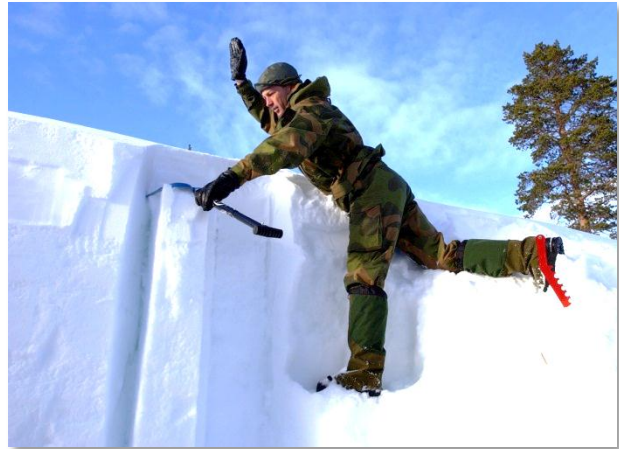
The threat of avalanche presents a real danger to Marines training in Norway's subarctic climate and rugged terrain.

Some of the near-term safety-related challenges include meeting international search and rescue obligations and responding to incidents such as oil spills in ice-covered waters, as reflected in the recently concluded Agreement on Cooperation on Aeronautical and Maritime Search and Rescue in the Arctic and Agreement on Cooperation on Marine Oil Pollution Preparedness and Response in the Arctic. The Department will leverage existing capabilities to respond to requests for support from civil authorities in coordination with other departments and agencies and nations.