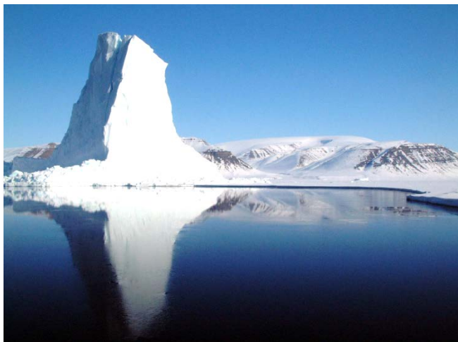
An iceberg at the edge of Baffin Bay's sea ice is just one of the many sights from Thule Air Base, Greenland.

The Arctic 1 is at a strategic inflection point as its ice cap is diminishing more rapidly than projected 2 and human activity, driven by economic opportunity—ranging from oil, gas, and mineral exploration to fishing, shipping, and tourism—is increasing in response to the growing accessibility. Arctic and non-Arctic nations are establishing their strategies and positions on the future of the Arctic in a variety of international forums. Taken together, these changes present a compelling opportunity for the Department of Defense (DoD) to work collaboratively with allies and partners to promote a balanced approach to improving human and environmental security in the region in accordance with the 2013 National Strategy for the Arctic Region . 3