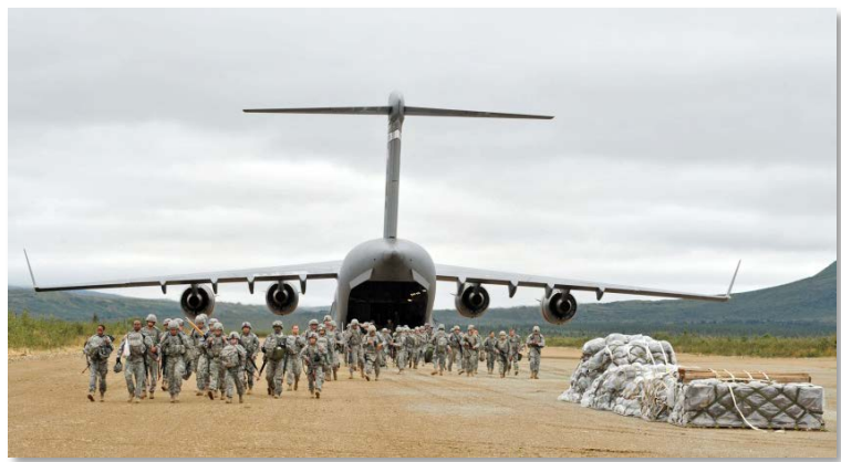
A C-17 Globemaster III aircraft and its aircrew assist in deploying 120 Soldiers for Operation Arctic Response, an Army Emergency Deployment Readiness Exercise.

Protect the Homeland and Exercise Sovereignty. From the U.S. perspective, greater access afforded by the decreasing seasonal ice increases the Arctic's viability as an avenue of approach to North America for those with hostile intent toward the U.S. homeland, and the Department will remain prepared to detect, deter, prevent, and defeat threats to the homeland. Additionally, DoD will continue to support the exercise of U.S. sovereignty. In the near-term 10 , this