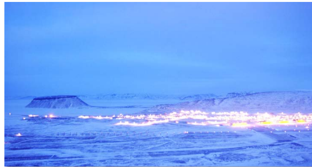
From South Mountain, Thule Air Base and Mount Dundas are captured during a short period of January twilight in Greenland.

leverage existing U.S. Government, commercial, and international facilities to the maximum extent possible in order to mitigate the high cost and extended timelines associated with the development of Arctic infrastructure. If no existing infrastructure is capable of sufficiently supporting the requirement, modifications to existing bases, such as the addition of a new hangar, will be made as part of the military construction or facilities sustainment, restoration, and modernization processes.