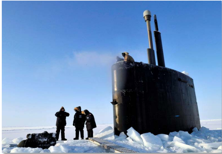
Members of the Applied Physics Laboratory Ice Station participate in Ice Exercise (ICEX) to assist operations and training in the challenging and unique environment that characterizes the Arctic region.

The Department's two supporting objectives describe what is to be accomplished to achieve its desired end-state. These objectives are bounded by policy guidance, the changing nature of the strategic and physical environment, and the capabilities and limitations of the available instruments of national power (diplomatic, informational, military, and economic). Actions taken to achieve these objectives will be informed by the Department's global priorities and fiscal constraints. In order to achieve its strategic end-state, the Department's supporting objectives are: