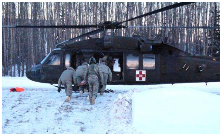
Soldiers conduct medical evacuation training at Fort Wainwright, Alaska.

The Department will pursue comprehensive engagement with allies and partners to protect the homeland and support civil authorities in preparing for increased human activity in the Arctic. Strategic partnerships are the center of gravity in ensuring a peaceful opening of the Arctic and achieving the Department’s desired end-state. Where possible, DoD will seek innovative, low-cost, small-footprint approaches to achieve these objectives (e.g., by participating