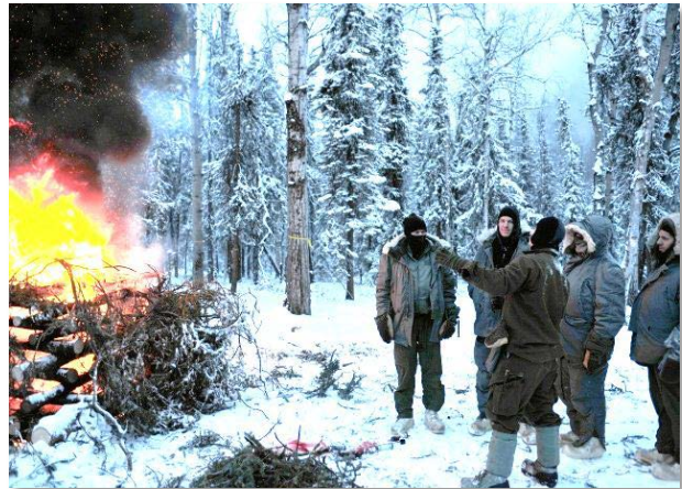
Arctic Survival School teaches signal fires.

key will be to address needs over time as activity in the Arctic increases, while balancing potential Arctic investments with other national priorities. This approach will help the United States achieve its objectives as outlined in the National Strategy for the Arctic Region while mitigating risks and overcoming challenges presented by the growing geostrategic importance of the Arctic.